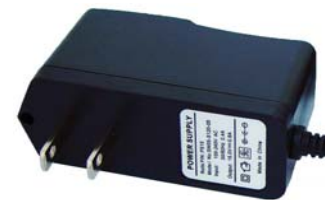
Included - ROLLS PS15 external power supply